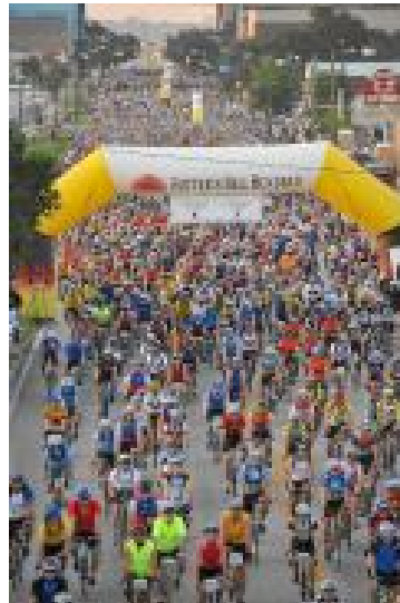
An impressive site as 12,000 riders set out on the 100-mile course.